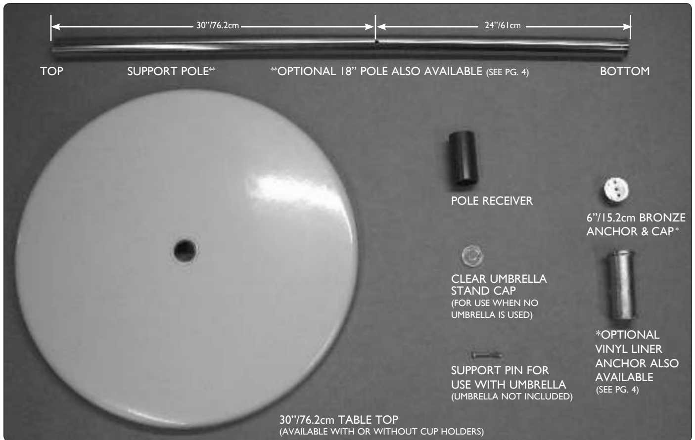
FIGURE 1: Pool/Spa Table Parts: Support Pole, 6”/15.2cm Bronze Anchor, 30”/76.2cm Table Top, Pole Receiver, Clear Umbrella Stand Cap, & Umbrella Support Pin (NOT SHOWN: optional 18”/45.7cm support pole; optional vinyl liner pool anchor)