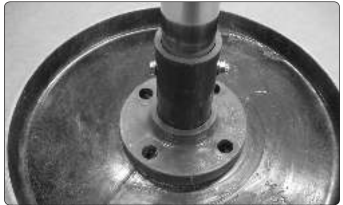
FIGURE 10: POOL/SPA SEAT RECEIVER POLE SEATED INTO POOL/SPA SEAT