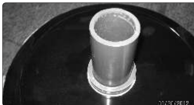
FIGURE 6: PROPERLY GLUED POLE RECEIVER SHOWN