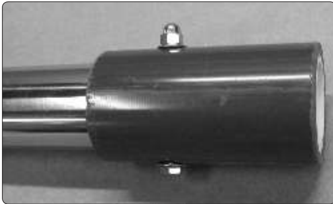
FIGURE 9: POOL/SPA SEAT RECEIVER POLE