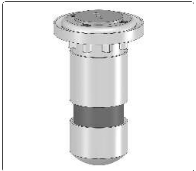
FIGURE 12: OPTIONAL VINYL LINER ANCHOR