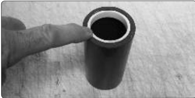
FIGURE 2: POLE RECEIVER