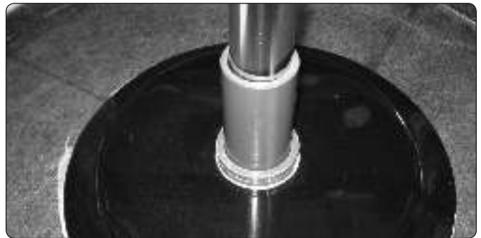
FIGURE 5: POLE RECEIVER ATTACHED TO TABLE FLANGE