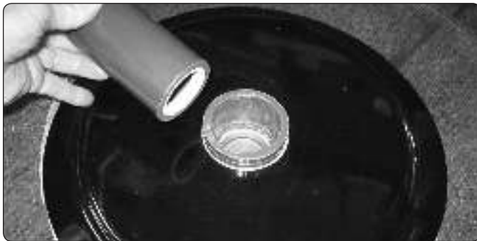
FIGURE 4: POLE RECEIVER SHOWN WITH TABLE FLANGE