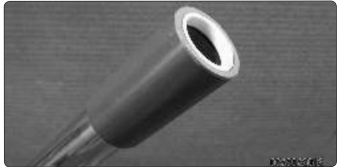
FIGURE 3: POLE RECEIVER ON SUPPORT POLE