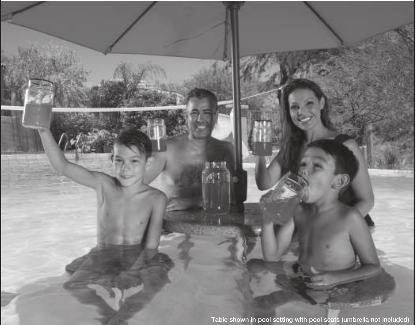
Table shown in pool setting with pool seats (umbrella not included)