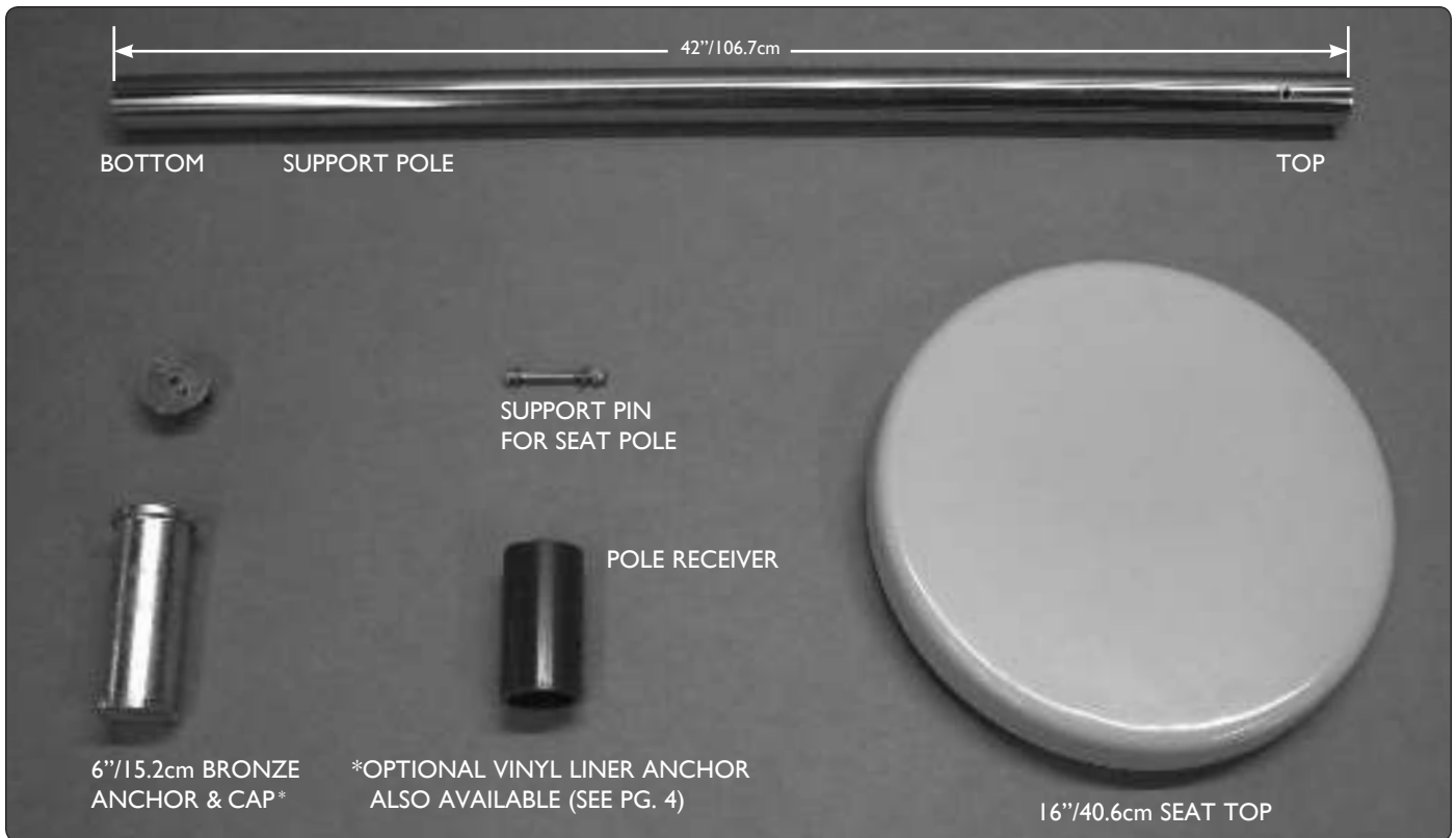
FIGURE 7: Pool/Spa Seat Parts: Support Pole, 6”/15.2cm Bronze Anchor, 16”/40.6 Seat Top, Pole Receiver, and Seat Pole Support Pin (NOT SHOWN: optional vinyl liner pool anchor)